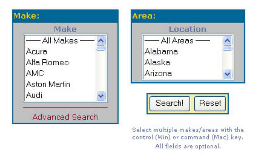
Figure A4: Web form for Car-Ads Search at http://www.carbuyer.com/, February, 2004.