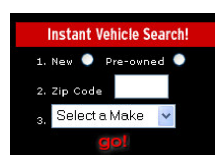
Figure 2: Web Form for Car Advertisement Search at http://dealernet.com/, February,

http://wwwheels.com/cfapps/searchindex.htm, December, 2003.