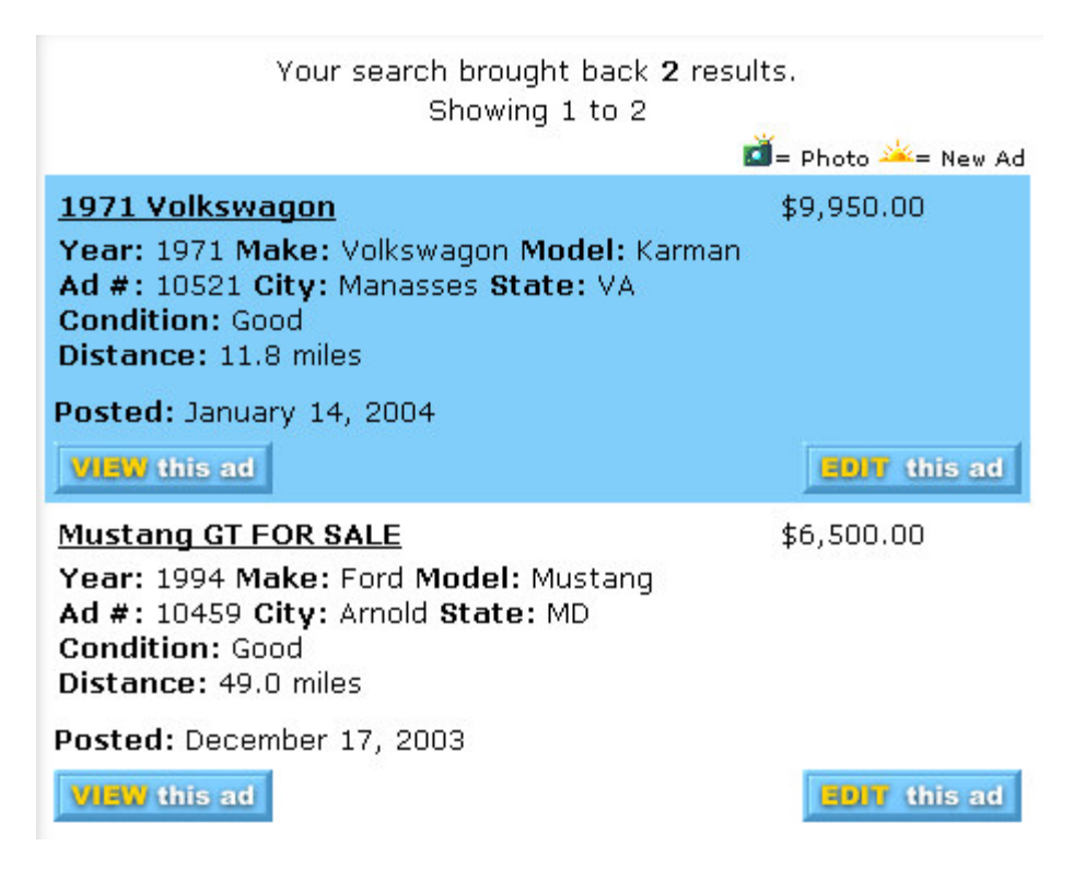
Figure 6a: Partial Retrieved Data for Cars Cost between $5,001 and $10,000 from

http://www.ads4autos.com/autos/index.cfm, February, 2004.