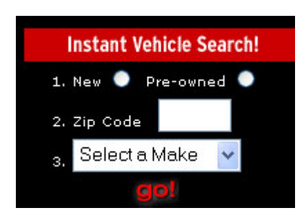
Figure A2: Web form for Car-Ads Search at http://dealernet.com/, February, 2004.