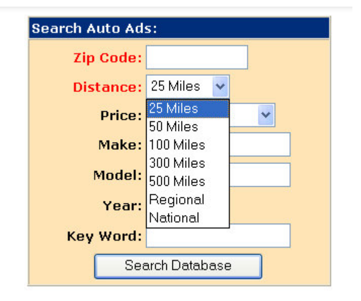
Figure 11: Web Form for Car Advertisement Search at http://www.ads4autos.com/autos/index.cfm, December , 2003.

For Type 1 fields such as the Price fields in Figure 1, our system creates two lists, an ordered lower bound value list and an ordered upper bound value list, and sets a flag (Paired) to "false" to indicate that the two ordered value lists are independent of each other. During this process, if our system sees keywords such as "any", "all", "don't care", etc., it sets the value to a default boundary value supplied by a data frame. (All data frames in our system that can participate in ranges always have a default minimum and maximum value.) The following two ordered lists are results from the process: