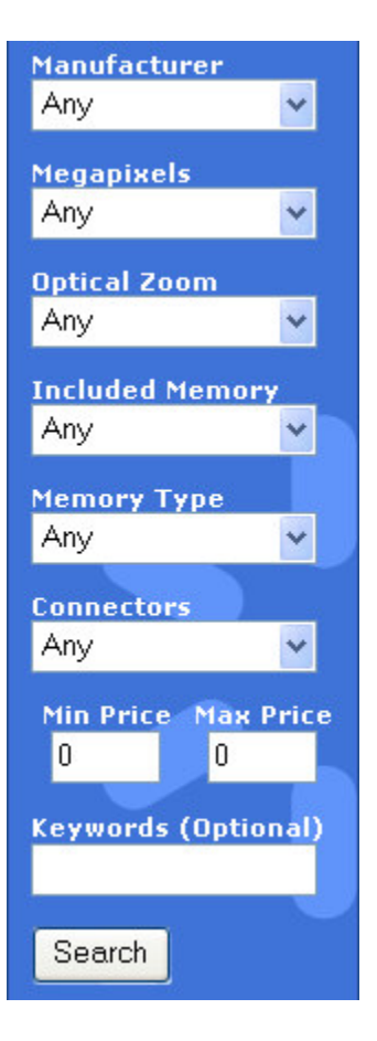
Figure A10: Web form for Digital-Camera Search at <u>http://dealcam.com/?ref=ov-</u> <u>digital_camera&sess=c6a1dd6e4adf00108692ae0f0d50b515</u>, <i>February , 2004.