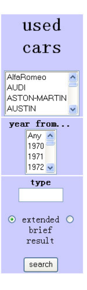
Figure A7: Web form for Car-Ads Search at <u>http://www.belcyber.net/cars/</u>, February , 2004.